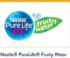
Nestle® PureLife® Fruity Water

Look for the Box Tops label on these products and more: